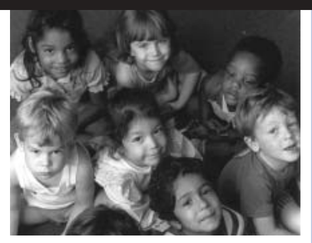
Conference Addresses Diversity in Child Care

n April 2002, about 200 hundred teachers, professors, early childhood teachers, students, and child-care directors attended an annual diversity conference organized by the Barshop Jewish Community Center of San Antonio's Early Childhood Program. A diverse group of organizations participated in the event including Carver Academy, Miller Child Development Center, Good Samaritan Center, PRS, City of San Antonio Children's Resources, San Antonio College Child Development Department, the Family Services Association's Smart Start for Teachers program, the Directors' Mentoring Program, and San Antonio Association for the Education of Young Children.